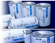
ANA original Junmai Sake on board