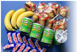
Snacks available on board