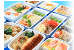
Your special dining room in the sky

For more information and reservations, consult your travel agent or call ANA Sales Americas San Francisco Office at 650-592-1860