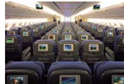
Personal Audio/Video System